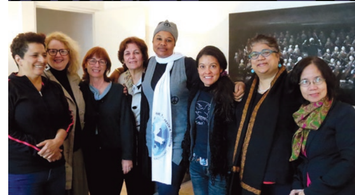
Cover Photo: Patricia Schroeder

WOMEN'S INTERNATIONAL LEAGUE FOR PEACE & FREEDOM US SECTION