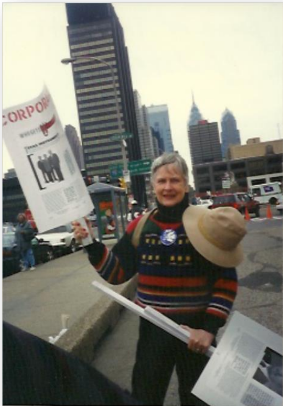
Tax Day, April 1996