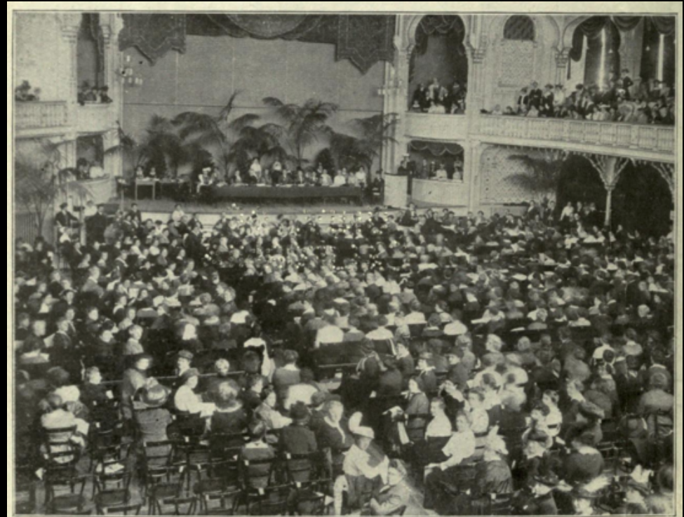
BUSINESS SESSION IN THE GREAT HALL OF THE DIERENTIUM—THE HAGUE