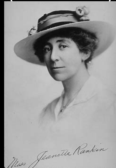
Jeanette Rankin (1880-1973)