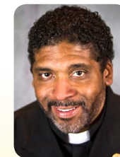
The Rev. Dr. William J. Barber, II

"Some things are not about left and right, democrat or republican, conservative or liberal, but about right and wrong. We need a moral movement to challenge the nation's elected leaders, to critique unjust policies and to lift the cries of the impacted and cause the nation to change and do better."